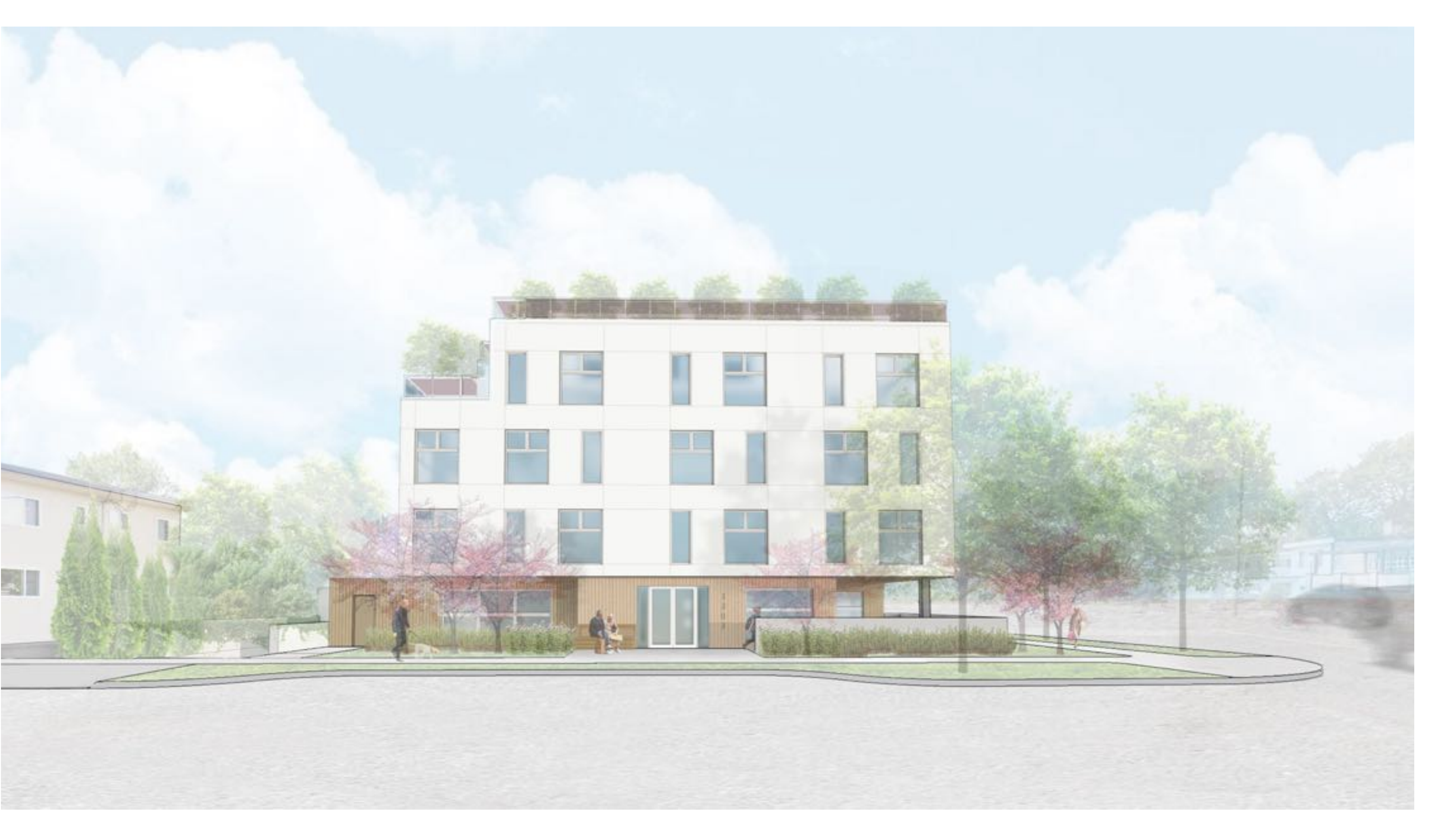
View from Mt. Benson St. looking South. The Affordable Housing steps up from three- to four-stories, presenting as residential in scale on the east side. The west side of the building remains a protective barrier to the noise of Terminal Ave.