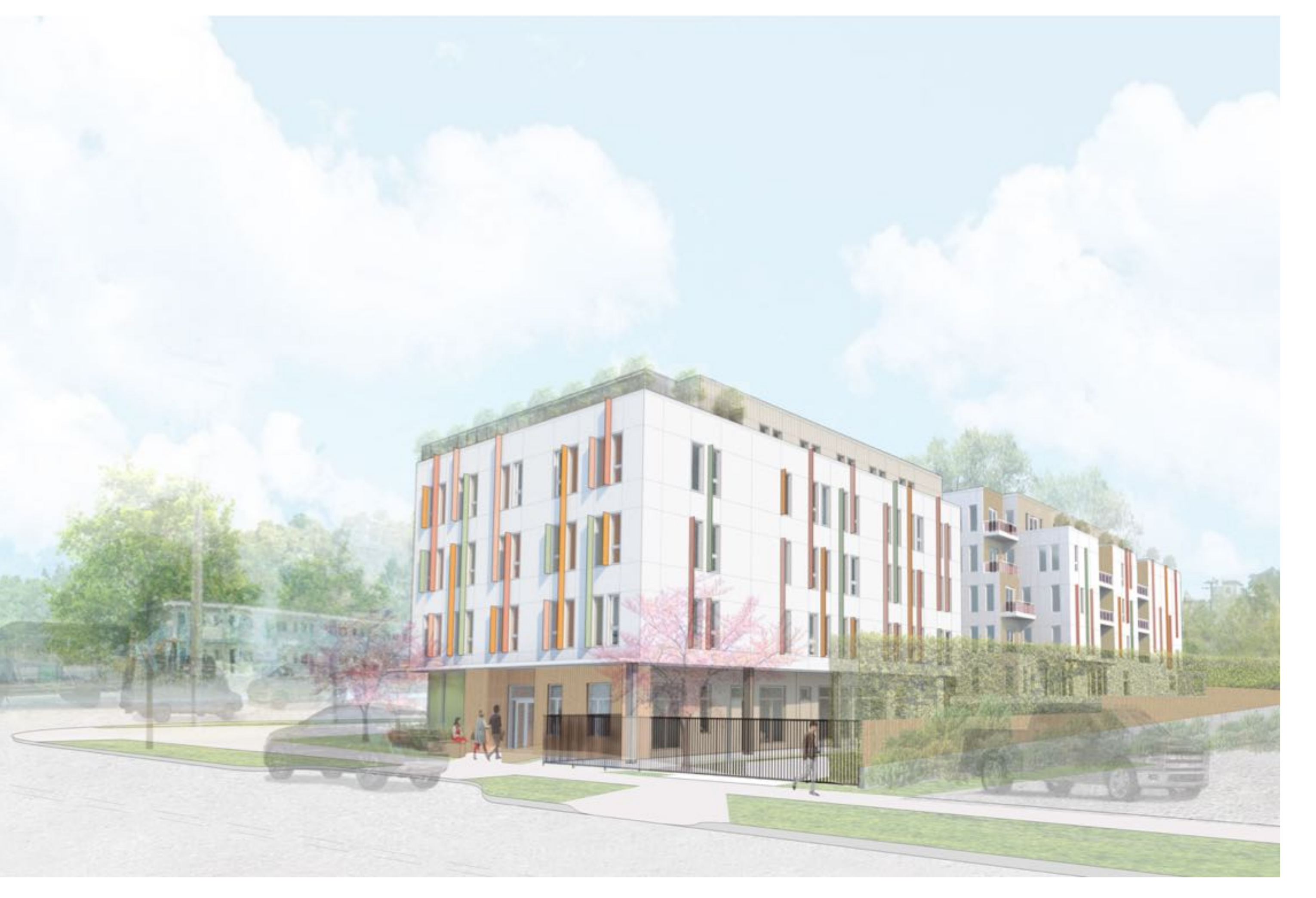
View from Bryden St. looking North. The Supportive Housing and Affordable Housing buildings step-back from the residential neighbourhood behind. Trees, a row of planting and a solid fence along the property line further obscure the buildings from the neighbourhood. The increased setback and rooftop planting redices the impact of the upper stories.