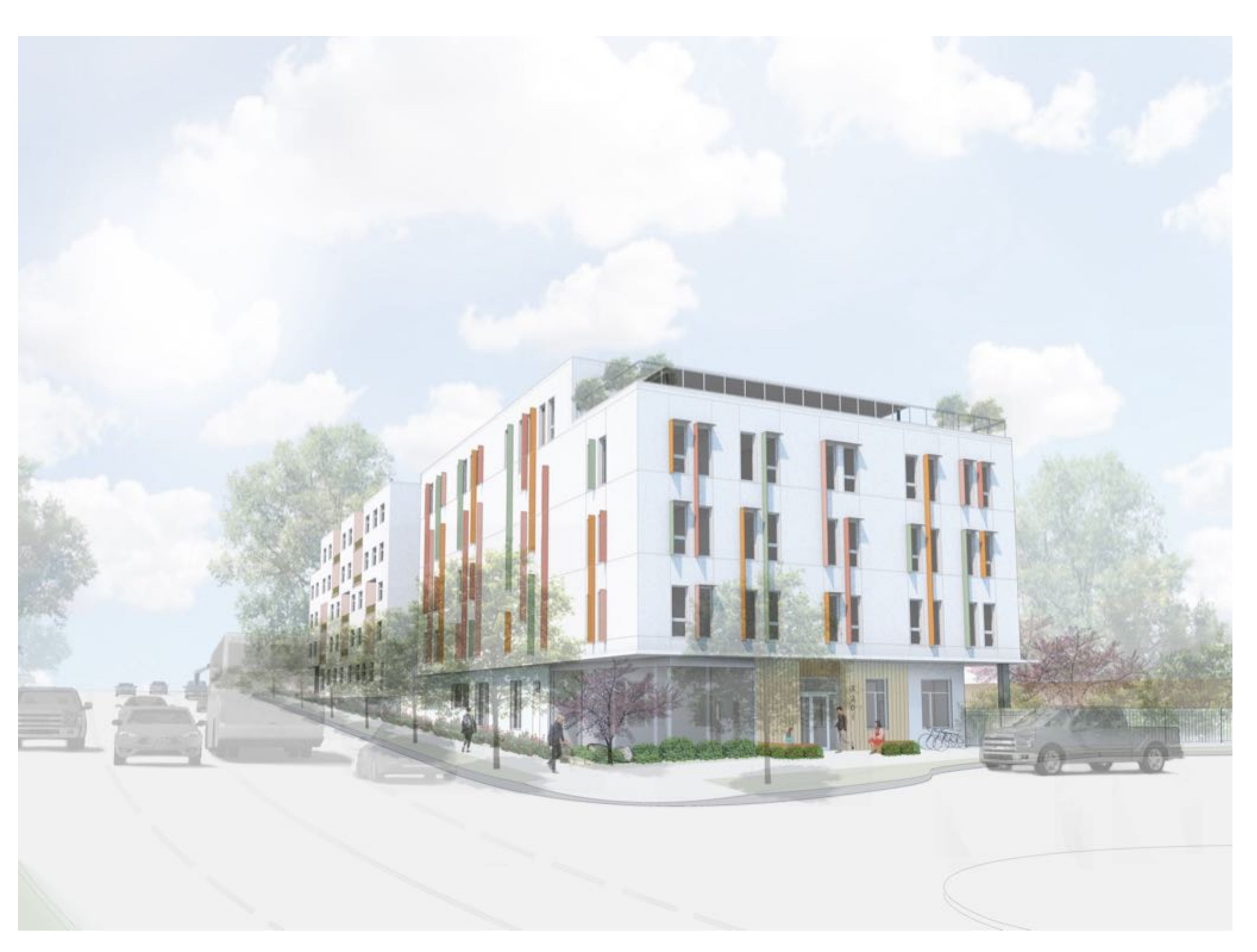
View from Terminal Ave. looking North. The Proposed Supportive Housing will present as a four-storey building, and progressively stack up as it climbs up the hill. The buildings serve to protect the residential neighbourhood behind blocking the sounds and emissions coming from Terminal Ave.